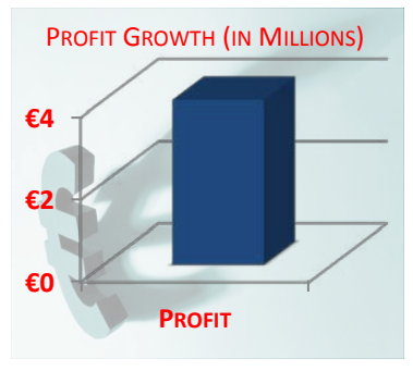
Grew prices 3% adding €4M profit